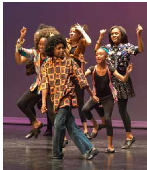
Students dancing at Drew Charter School

supervising the grant and providing general mentoring. My interaction with the Drew administration, teachers and students has been extremely fulfilling to me personally. It is apparent (and supported by research) that music and the arts in young children's lives will help them develop spatial recognition and math skills, as well as self-confidence and poise, and we believe that music, dance and the visual arts are enhancing the ongoing academic successes of the Drew Charter School. It has been a special joy of my retirement chapter to be a part of the Drew team as we continue to establish a culture of excellence and become a national model for comprehensive neighborhood revitalization.