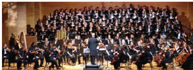
The annual Georgia State School of Music Gala Holiday Concert