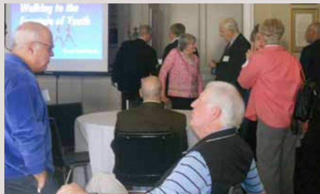
Emeriti mingle before the start of the Fitness and Fountain of Youth Program