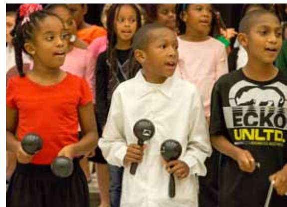
Chorus at Drew Charter School

Two years ago the state of Georgia recognized Drew's commitment to excellence by awarding a $1 million Race to the Top grant supporting the